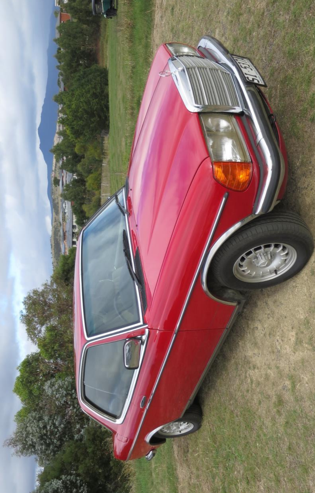
1984 Mercedes Benz 280 CE Coupe